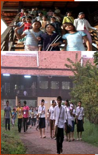
The community Centre for Youth Education