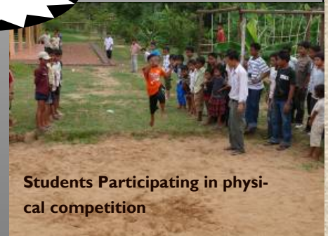
Students Participating in physical competition