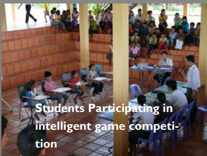
Students Participating in intelligent game competition

The competitions began early in April with some students went through several rounds and the best ones will end up at the final round on April 12, 2007.