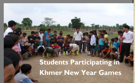
Students Participating in Khmer New Year Games